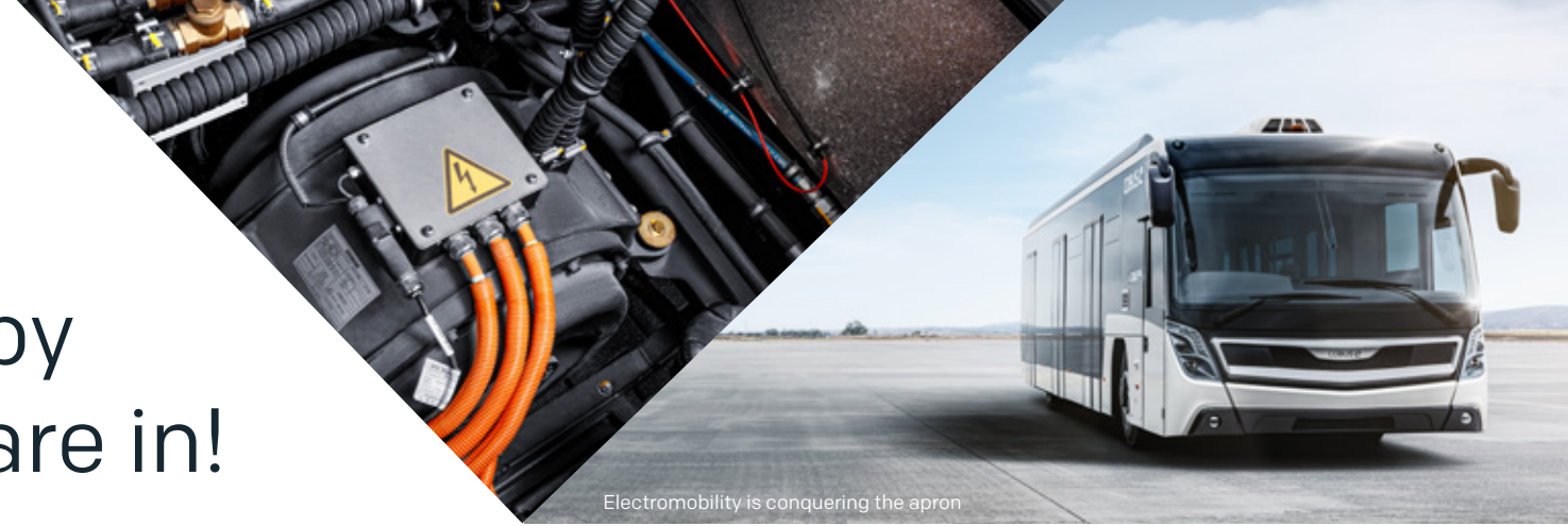
Electromobility is conquering the apron

How green can aviation and airports be? This is a question that GATE and its members deal with every day. We face the challenge of meeting rising passenger numbers with the best products and services, while ensuring that the design, construction and operation of airports and their processes are sustainable and environmentally sound.