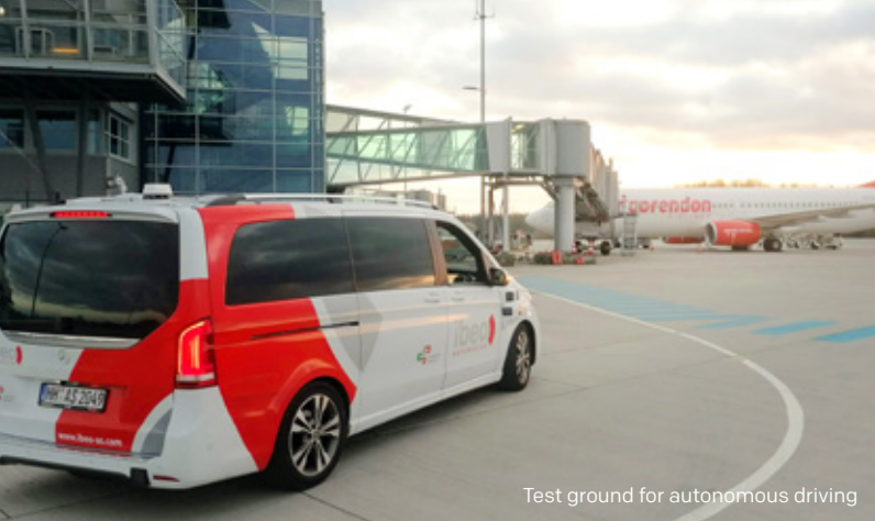
Test ground for autonomous driving